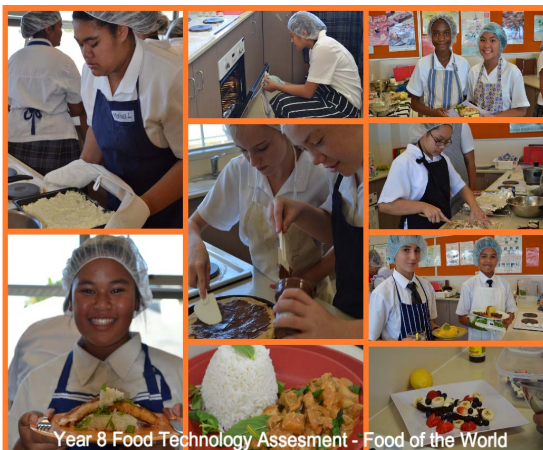
Year 8 Food Technology Assesment - Food of the World